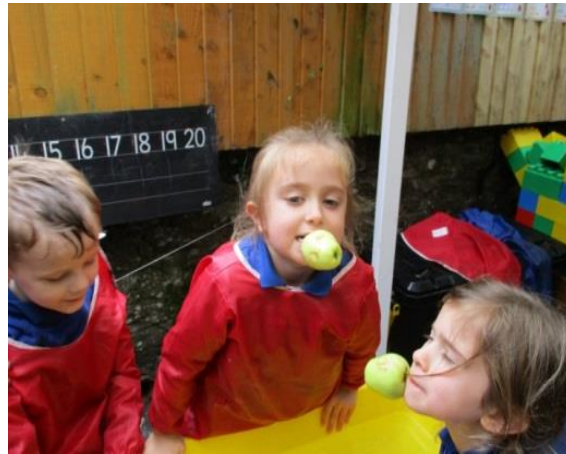
Acorns Pumpkin afternoon on Wednesday