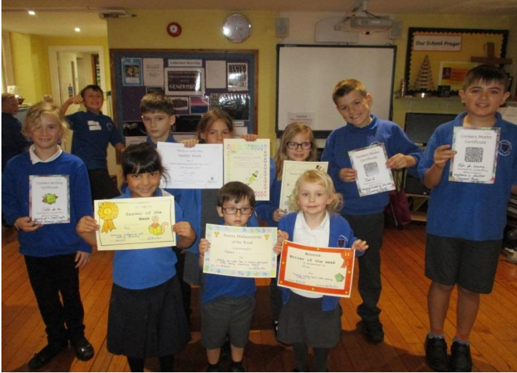
Last week's celebration assembly 18.10.19