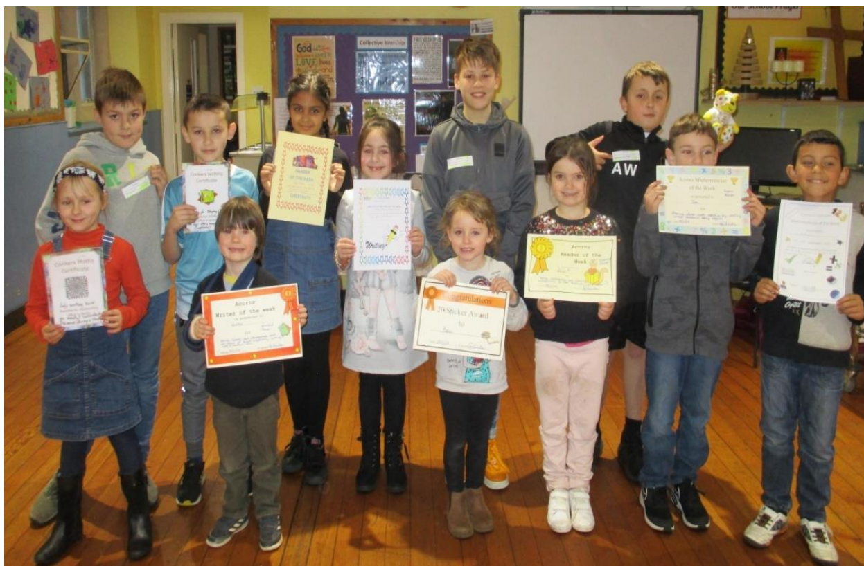
Celebration assembly awards last week