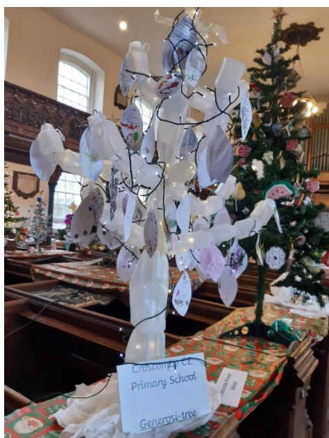
Croscombe School's Generositi-tree on display to view this weekend at the Baptist Church in Shepton Mallet.