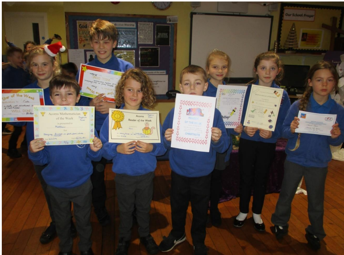
Celebration assembly awards last week

You can access previous copies of the newsletter here.