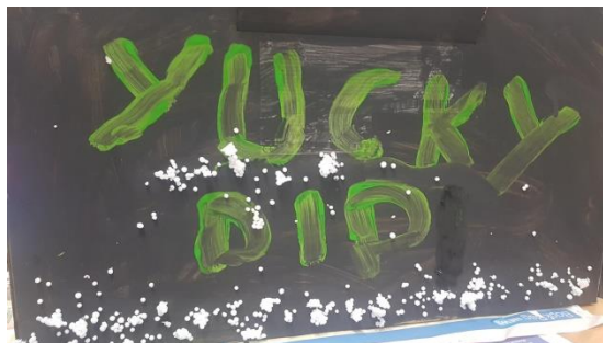
(Conkers Games for FOCS Christmas Fair)

Conkers Class – Conkers have had their Design Technology hats on this week as they planned and then built games for The Christmas Frost Fair. The class will be hosting the Games Room up in Conkers classroom. They have devised lots of challenging games.