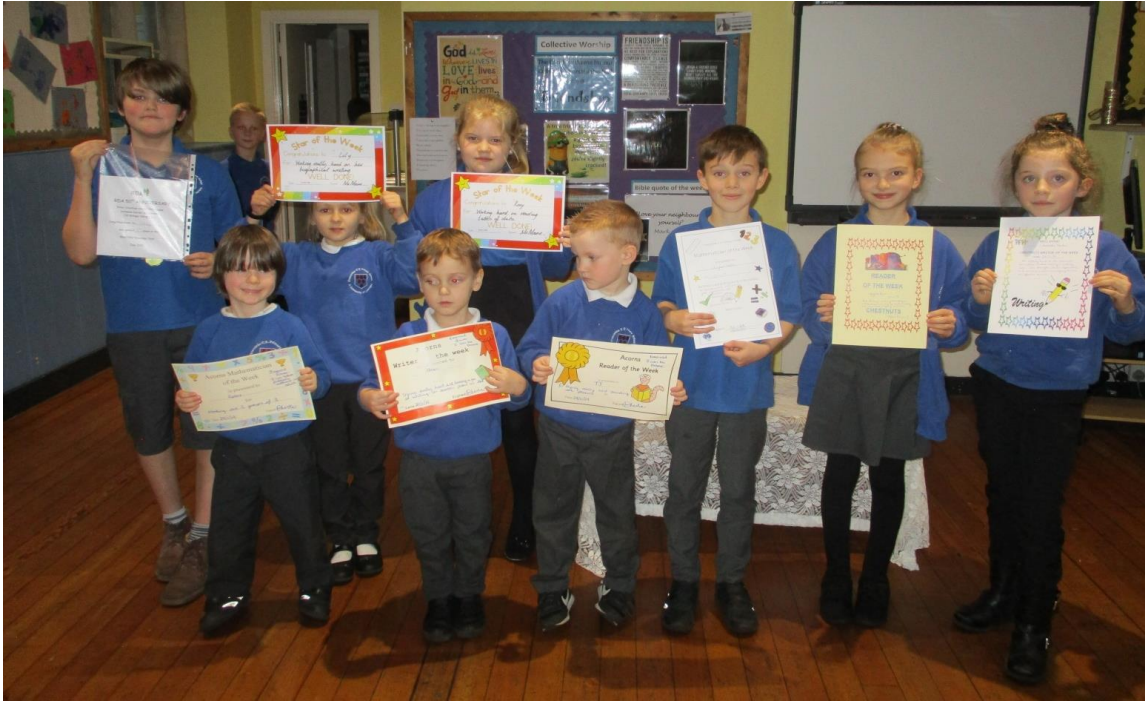
Celebration assembly awards last week

We are creating opportunities for awards across the school, not just writers, spellers and Mathematicians, so please join us in our Celebration Assembly on Fridays at 3.00 pm to celebrate the children's achievements and view work they have done in class.