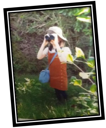
Our Maths INSPIRE afternoon