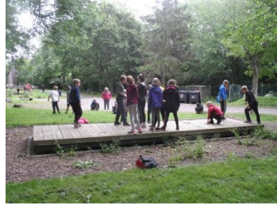
Some of Oaks Class budding explorers