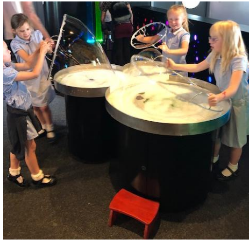
Who can make the biggest bubble?