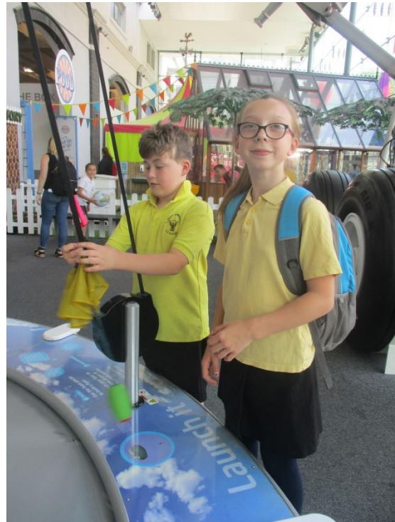
Finding out how long it takes to mill a teaspoon of flour...