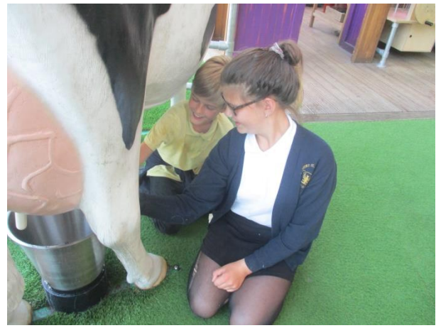
It's milking time