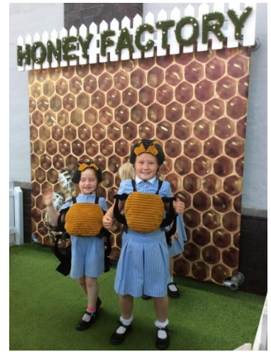
Our 'Worker Bees'